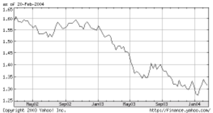
Fig. 1: Value of US Dollar Compared to Canadian Dollar

For several years, people who purchase these products in the US benefitted from the strength of the American Dollar. But over the past several months, a combination of economic and political factors has resulted in a steady decline in the value of the US Dollar compared to almost all major foreign currencies. For example as shown in Figure 1, in February 2003 a US dollar bought about 1.5 Canadian dollars; a year later it bought only about 1.3. As Figure 2 illustrates, there has been an even steeper decline compared to the Euro (the currency used in Italy and 10 other European countries), with the US Dollar losing over 16% of its value in less than one year.