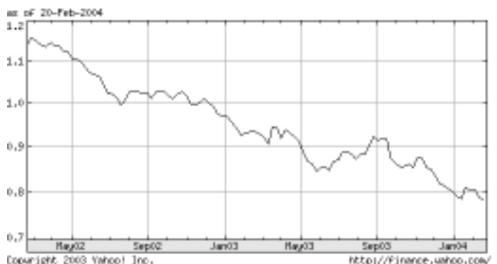
Fig. 2: Value of US Dollar Compared to Euro

One result of the falling US Dollar is that imported products are now significantly more expensive for American consumers, even if the companies that make them have not raised their prices.